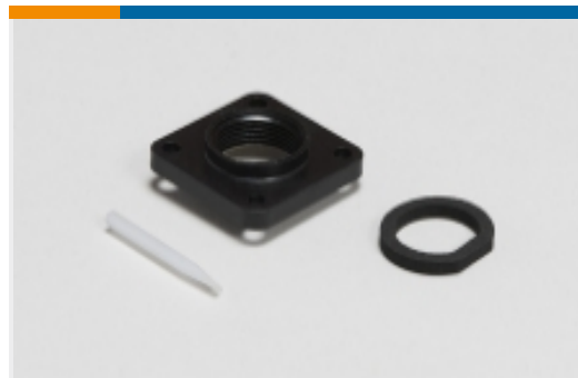
Circular Connector Seals(36)