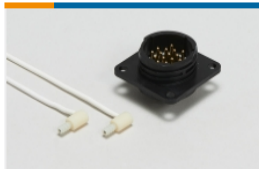
Circular Power Connectors(467)