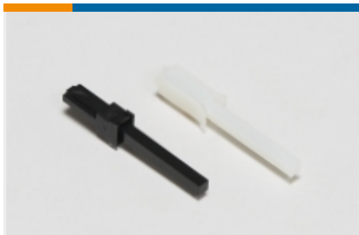
Circular Connector Keying Plugs(2)