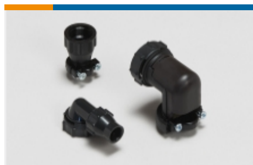
Unscreened Circular Connector Backshells & Clamps(56)