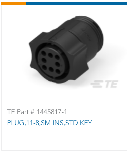
TE Part # 1445817-1 PLUG,11-8,SM INS,STD KEY