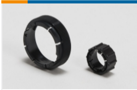
Circular Connector Adapters(7)