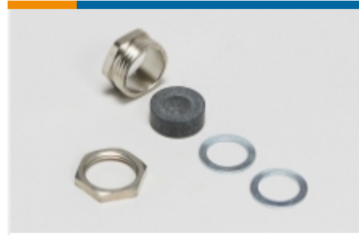
Circular Connector Hardware(3)